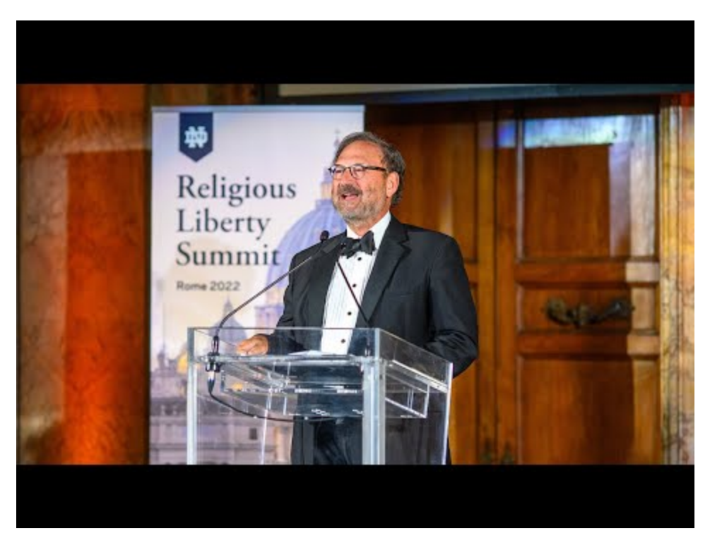
Watch Video At: https://youtu.be/uci4uni608E

Additional reportage comes from <u>BizPacReview</u> and <u>The Daily Wire</u>. BizPacReview has <u>another article</u> treating the criticism of the <u>Dobbs</u> decision by the Duke of Sussex.