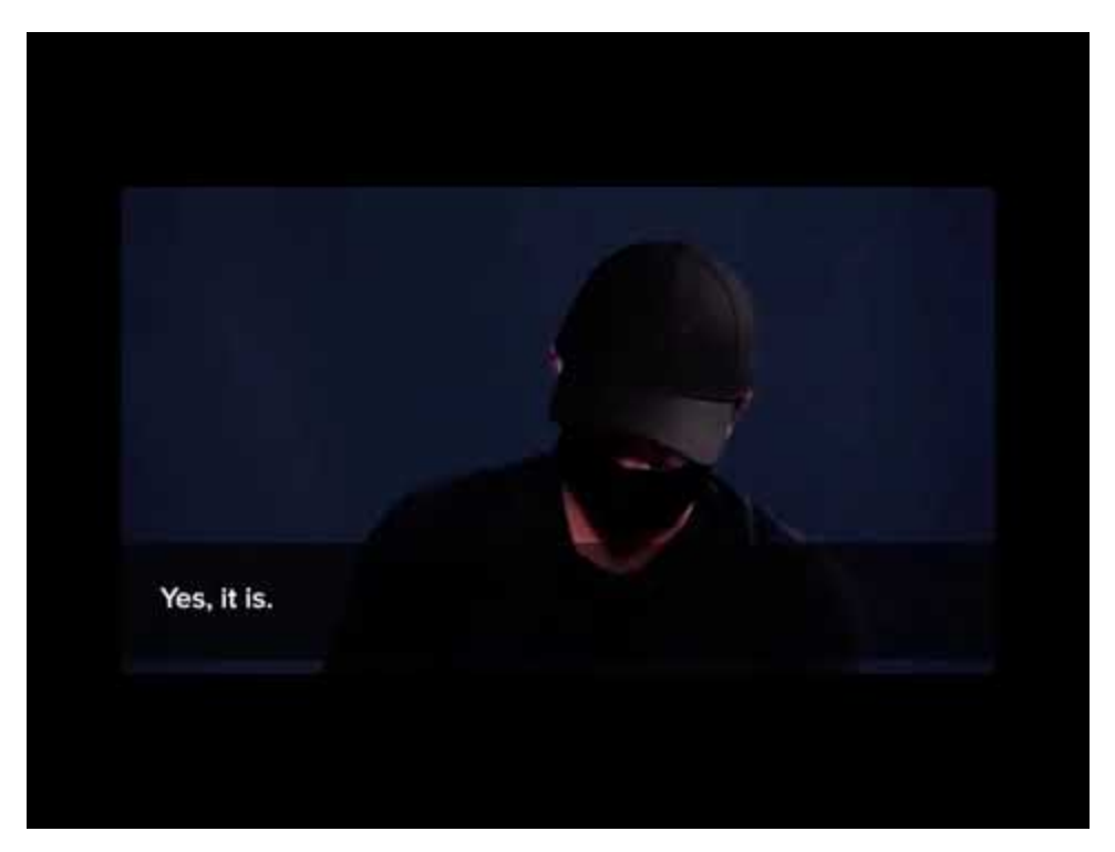
Watch Video At: https://youtu.be/iE9UeSHWEHQ