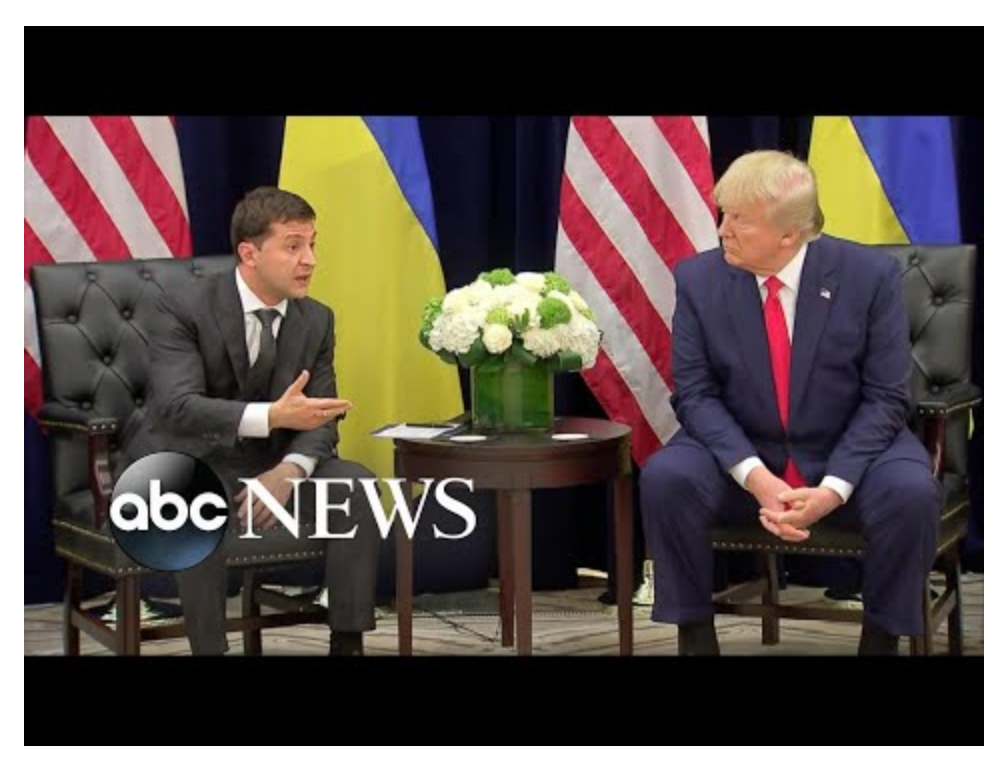
Watch Video At: https://youtu.be/pdiW9k7Qm7Q

Trump spoke glowingly of Zelensky – but not so glowingly of the corruption problem in Ukraine. The younger man had run for election on an anti-corruption platform. In a key moment, Trump specifically suggested that Zelensky confer with Vladimir Putin of Russia to "solve his problem."