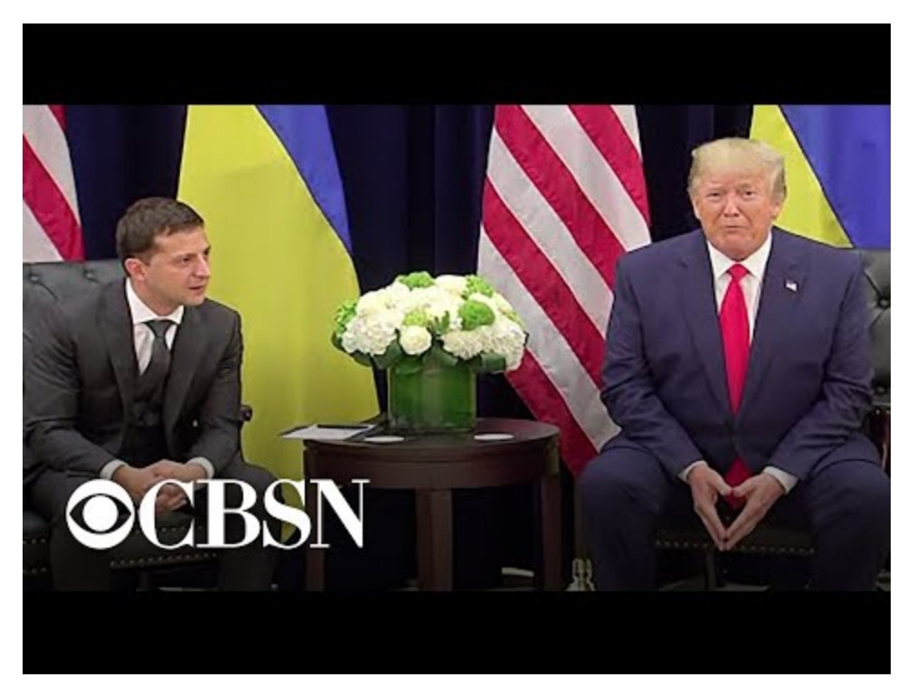
Watch Video At: https://youtu.be/OLAdt7K9LpQ

The very next day (September 25), Trump and Zelensky met face-to-face in New York City.