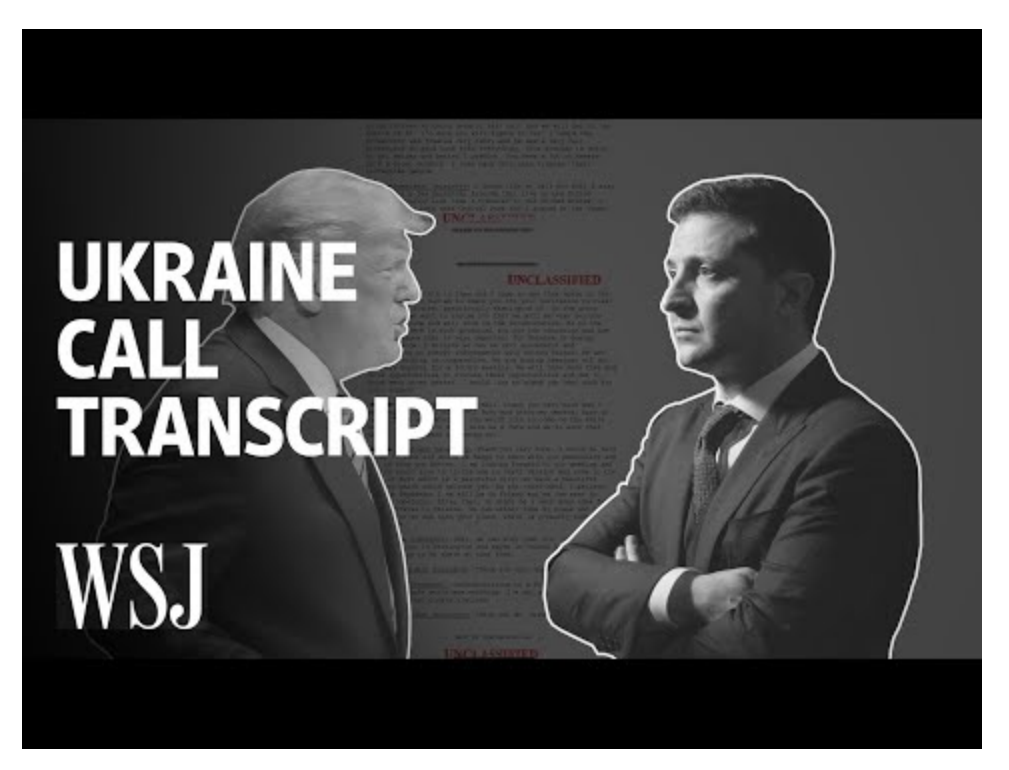
Watch Video At: https://youtu.be/IBXnmMf9IU4

The very next day (September 25), Trump and Zelensky met face-to-face in New York City.