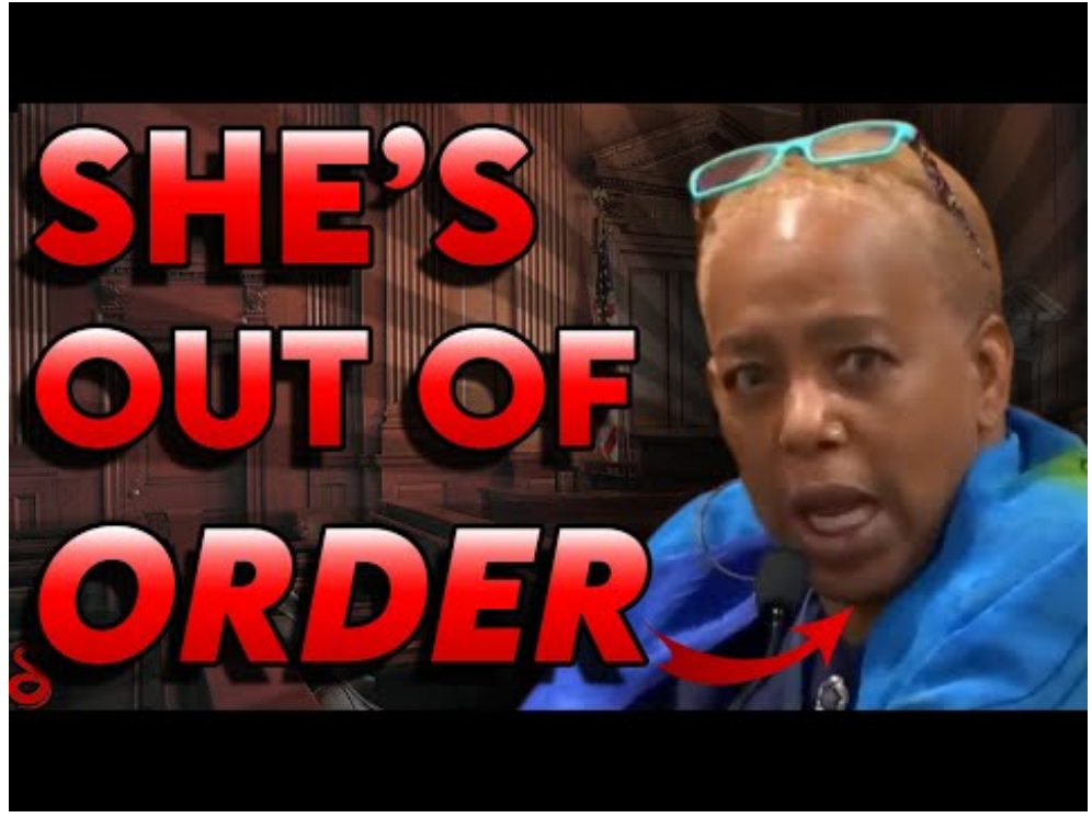
Watch Video At: https://youtu.be/qldzGjuKWj4

<u>ARVE (Advanced Responsive Video Embedder)</u> Error: Need Provider and ID to build iframe src