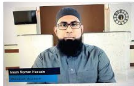
Imam Noman Hussain

the use of female sex slaves, the killing of adulterers, and the incitement of hatred against Jews.