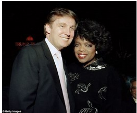
Donald Trump with Oprah Winfrey in his pre-Presidential years.