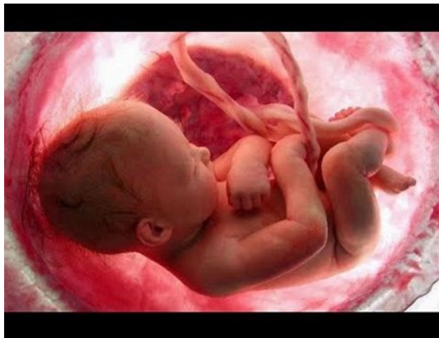
An unborn child takes sustenance through the umbilical cord.

I happen to live about 18 minutes from New York City, in one of the meccas of leftwing madness on Long Island. In my suburban community, a Marxist Forum actually exists. Here voters overwhelmingly cast their ballots for Democrats. Those Democrats include a state legislature that not long ago stood on their feet and applauded a law to allow mothers in labor to end the lives of their fully developed, nine-months-in-utero babies literally one minute before birth. You read that right—applauded!