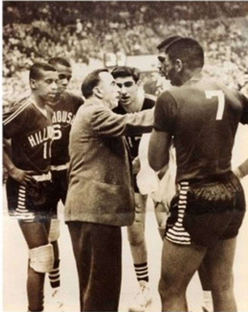
A group of black basketball players cordially surround their white teammate as they prepare to play.