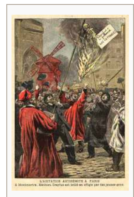
Young street toughs in Paris burn Mathieu Dreyfus, Alfred Dreyfus' older brother, in effigy in an anti-Semitic riot at the height of the Dreyfus Affair. Cover art from Le Petit Parisien, artist unknown.

The Quran contains at least 109 verses that call all Muslims to war with non believers for the sake of Islamic rule, some quite graphic. Aloof from historical context, they proudly regard themselves as part of the eternal and unchanging word of Allah.