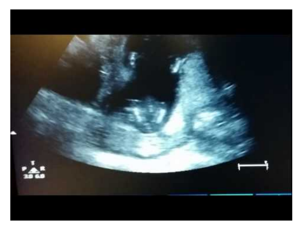
Watch Video At: https://youtu.be/mR6POuFfFNU