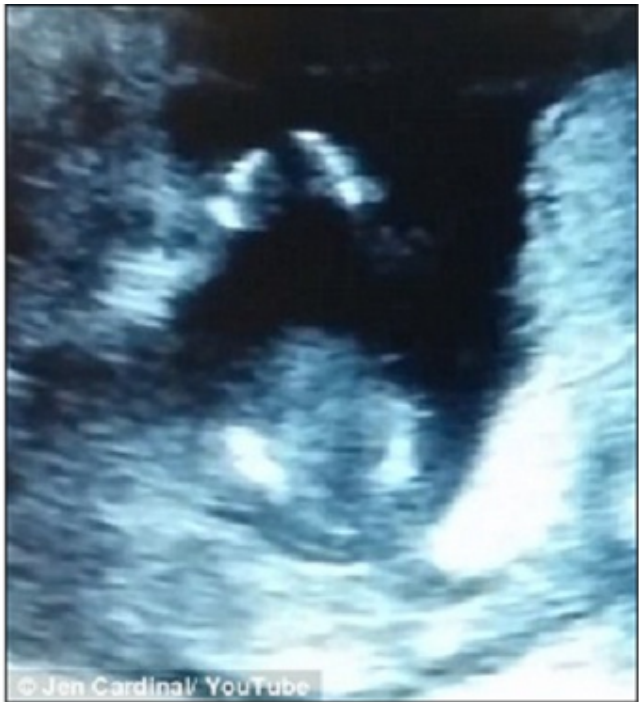
Watch the Cardinals' baby clap to the nursery rhyme the video below!