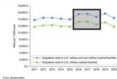
FIGURE 1. Rates of ambulatory visits by year, active component, U.S. Armed Forces, 2011–2020

The 2021 data (which Mathew believes nobody had bothered to falsify on a massive scale while the data was still coming in) shows an elevated signal for various medical events, distributed among a range of categories of medical billing codes.