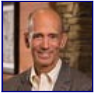
Dr. Joseph Mercola

Suppression and harassment of those who dissent against COVID tyranny has created an awakening. We simply can't pick and choose approved speech.