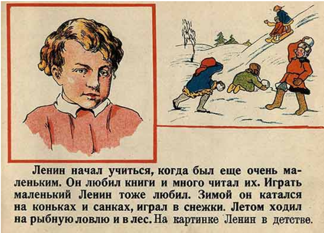
Lenin / Text by V. Shurko; Drawings by E. Gorodetskaya. 1928