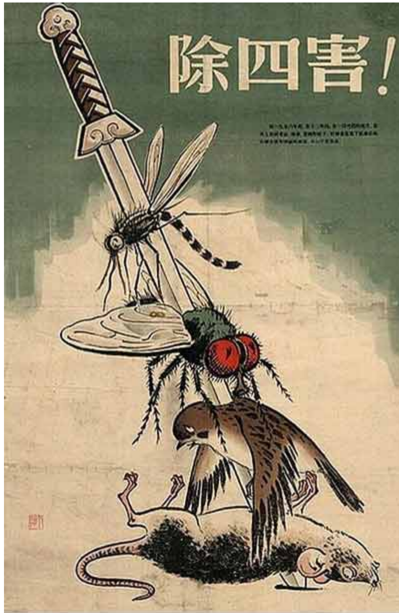
1958 poster, 'Exterminate The Four Pests!'

One of the "great" ideas that emerged during this period was that four pests needed to be eliminated: